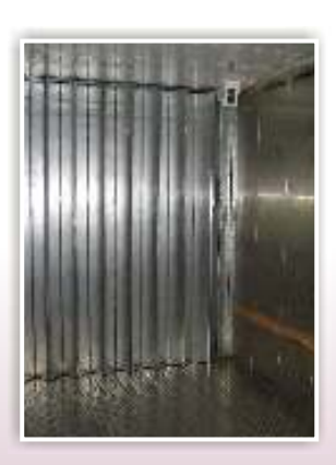
S.S. Shutter Gate