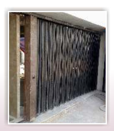
Motorised Shutter Gate